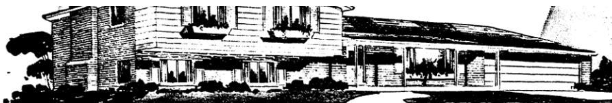
The modern STAR SAPHIRE . . . 3 or 4 bedrooms, 2 car garage, 3 baths, separate eating area, natural brick fireplace, rec. room, Tri-level . . . $22,900

More home than you thought you could afford!