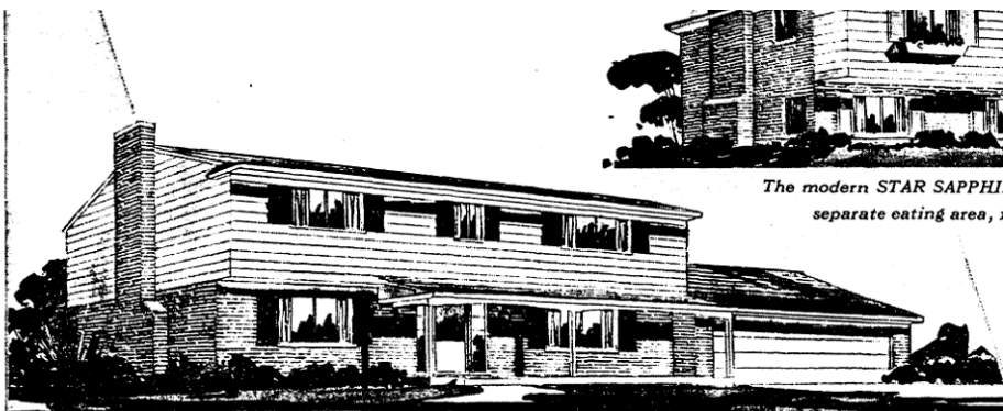
The gracious SAPHIRE . . . 4 bedroom, 2 car garage, full open basement, separate dining room Colonial . . . $21,900